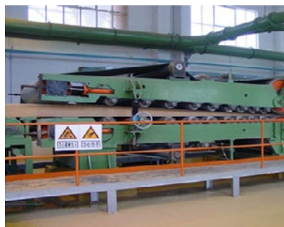
A prepress machine in operation