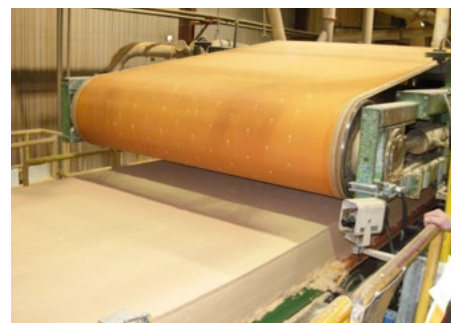
A seamless endless woven prepress belt in action

The local partner of choice for sustainable conveyor belting solutions - around the globe.